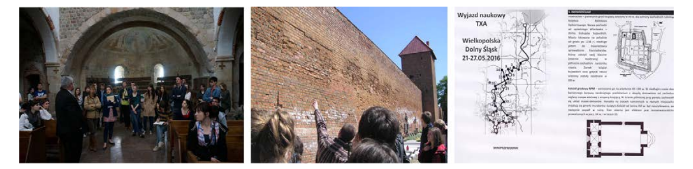
Figure 1: Students participating in the study tour classes (left and middle); an extract from a typical student guidebook, prepared before the study tour (right).

Students prepare for the tour by making mini guidebooks. They contain plans, sections of objects and the most crucial information (Figure 1). They help in recognising historical architecture and memorising its features. They are also a place to record comments and observations. Apart from domestic Polish tours, visits to selected European cities are also organised. These tours aim to expand knowledge about trends in architecture from neighbouring countries. They usually complement knowledge of Polish buildings, identifying similarities and differences.